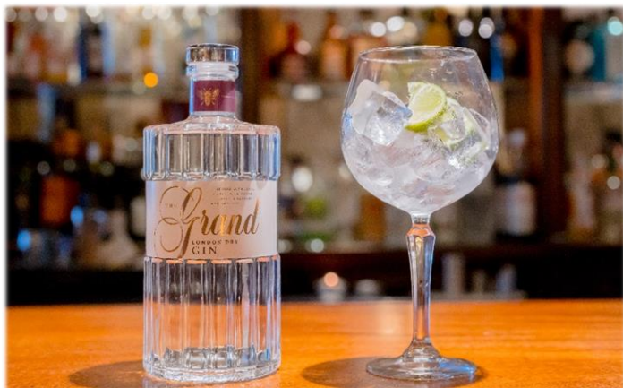
Grand Gin (50ml) and Fever Tree Tonic - £17.60

The Grand Gin has a unique flavour that uses locally sourced botanicals including Honey, wild Gorse, and Samphire, that are handpicked from the coastline just a stone's throw from the Hotel