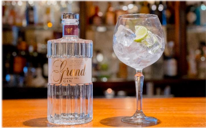
Grand Gin (50ml) and Fever Tree Tonic - £24.05

The Grand Gin has a unique flavour that uses locally sourced botanicals including Honey, wild Gorse, and Samphire, that are handpicked from the coastline just a stone's throw from the Hotel